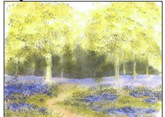
Stages 4 and 5